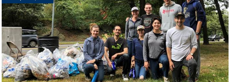
Emerald Necklace Conservancy Clean-up Team, 2019