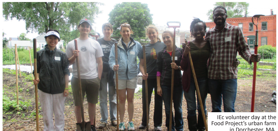
IEc volunteer day at the Food Project's urban farm in Dorchester, MA.