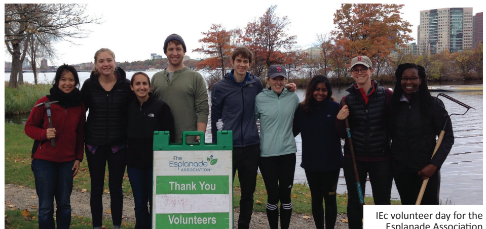
IEc volunteer day for the Esplanade Association